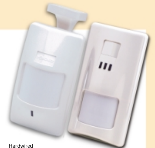
Hardwired Motion Sensors