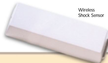
Wireless Shock Sensor

For large glassed areas eg. shop front, a shock sensor can be used to detect vibrations, notifying the security system if someone has forced or broken the window.