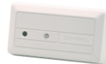
Hardwired Glass Break/Shock Sensor